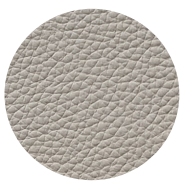
Pale Grey Full Leather Light Wood Base