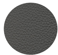
Charcoal Full Leather Light Wood Base