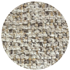
Egyptian Sand Fabric